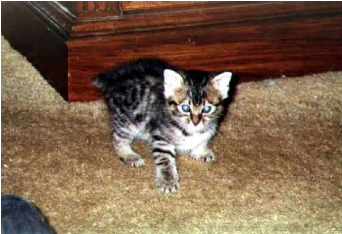
This picture was taken during his first week in the house.

That evening when I got home from work, I took some pictures of him. He now stayed with me as if I were his mother and it was difficult to get far enough away to take the pictures. For the rest of the week, he lived in the pet carrier. He did not like being in there and would squeak and shake the door. In the evenings I would take him out to play.