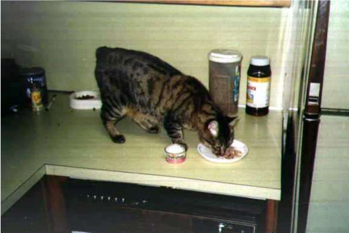
Eating his favorite breakfast on the kitchen counter one Saturday morning.

On weekends when I slept late Fluffy would sometimes walk up to my face and purr and then go back towards my feet and sleep in too. Other times he played with his toys. When I got up he watched me real close. The moment I started towards the kitchen he would run full speed ahead with a bunny hop and be up on the kitchen counter when I arrived. He was anxious to get some canned food. His tail would be vibrating, and he would step his hind legs.