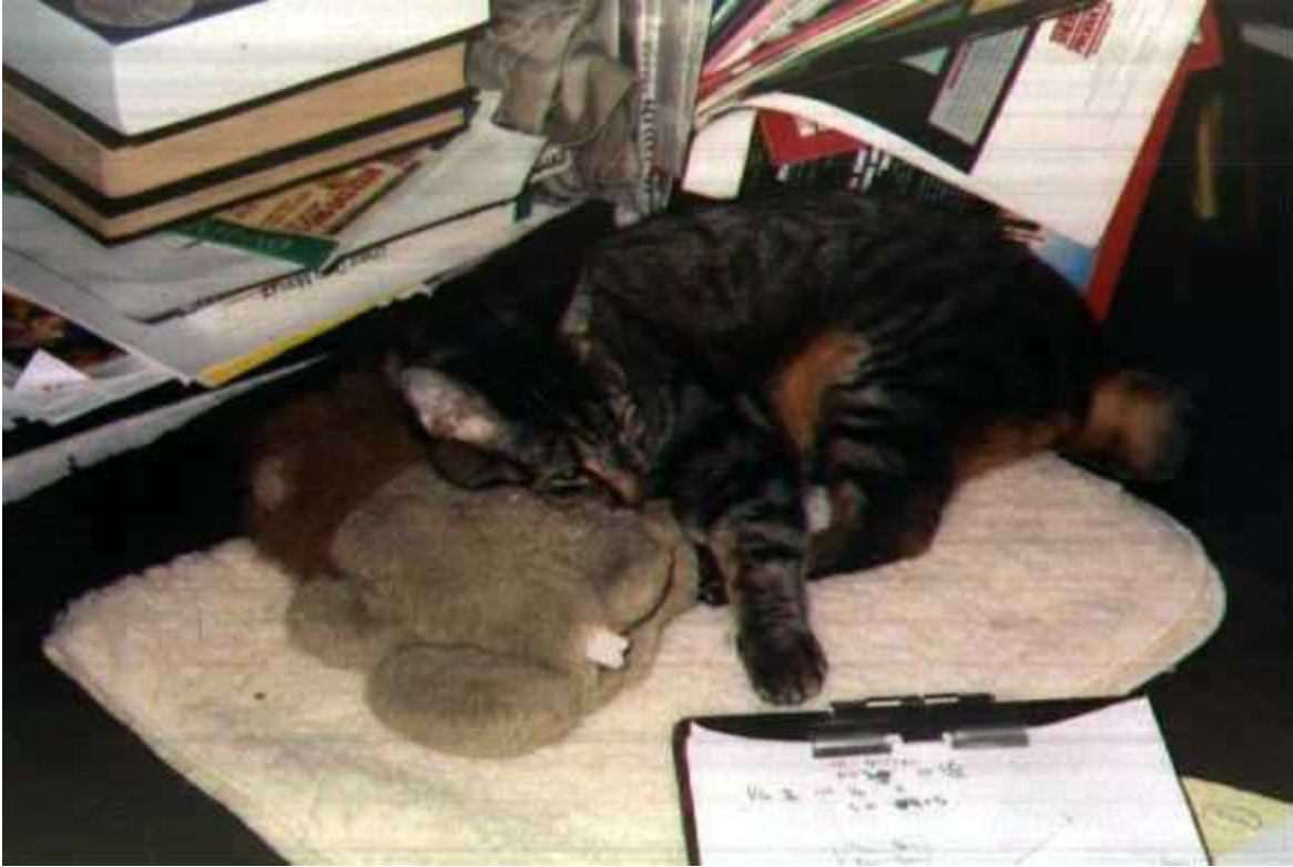
Sleeping on my desk with his lion puppet.

Wednesday, December 12: Fluffy was no better in the morning so I took him back to the vet. His blood levels were still off the scale. They continued to give him fluids. When I picked him up at about 5:30 that evening he seemed very perky and in good spirit. He was eager to walk around when he got home. He only ate a few kibbles of his special dry food. By 6:00 he had slowed down a lot. I gave him some catnip and he ate a little. I brought him his favorite feather toy. He promptly grabbed it and began mauling it as usual as he growled at it. Then I noticed some blood on the feathers. He lost interest in the toy. He slept on my desk as I graded final exams. There was a small crust of blood around his mouth. He would grind his teeth every few minutes. He looked very pitiful and was obviously feeling very bad. I was afraid that he would be dead within a day or so since it seemed that his kidneys had failed. I told Fluffy many times that I would do everything I could for a pussy cat.