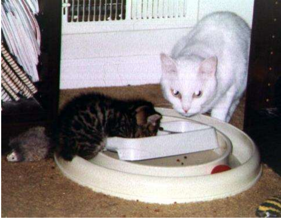
Eating with Frisky.

Fluffy quickly joined the ritual of canned food on the weekends. He would use the den sofa to get up on the kitchen counter. This remained his method all through his life. While I would prepare the food, Stubby would be yowling with impatience. Itsy was up on the counter meowing too. Fluffy would try to join in the meows but all he could do was squeak. Every attempt at meowing sounded pitiful. He eventually gave up and just quietly waited for his food while vibrating his tail with excitement.