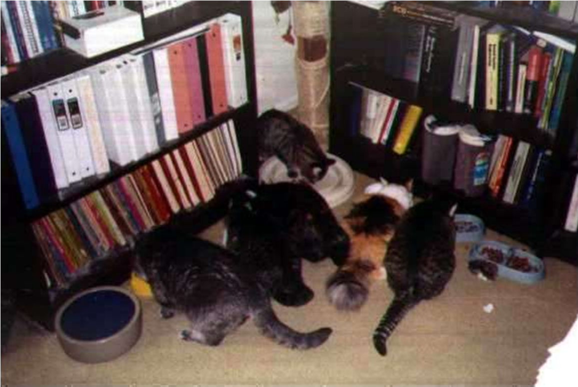
Eating at his favorite spot in the corner.

Fluffy liked to get up on my office desk to watch me work. He would also sleep there too. He would swat at me if I tried to move him a little out of the way to get to something. He would swat at anything that moved. I would sometimes goose him with my pencil or pen, and he loved to fight it. Sometimes I would goose him with a ruler which was long enough so that he could not reach my hand. I would touch his paws and fluff tail. He was very protective of his tail and would get very mad at the ruler. If I opened the drawer he loved to check out what was inside looking for anything that could become a toy. But other times I would pet him and rub him under his chin. I would rub his nose when he slept. He loved this and his tail would wiggle back and forth with approval. Sometimes he would briefly purr. The last time I heard him purr was a few weeks before he died.