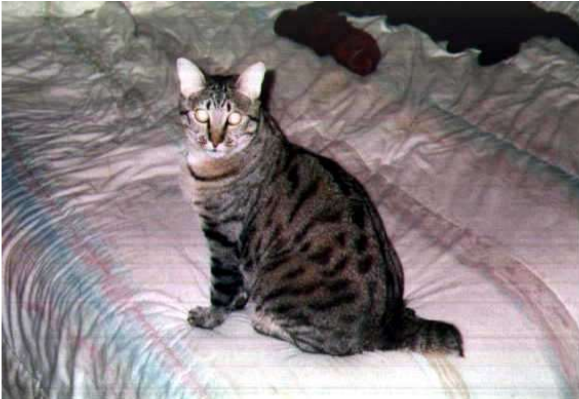
Sitting on the bed with Spooky.

and remained friends until Fluffy died. Fluffy then forgave me for bringing Bitsy into the house. Fluffy and Bitsy would often play chase and attack games. Fluffy was stronger and always won. The only time Bitsy would win was when I would hold Bitsy. Bitsy does not like to be held, and she would charge the first cat she saw when she got loose. All the cats learned to slip out of the room when I picked up Bitsy. For a long time, Fluffy would hold his position so he was her target. She would run over to him and bat him and he would run off. Later he would disappear long before I put Bitsy down. Fluffy would often mock maul Bitsy by jumping her and flipping her down and grasping her and biting her neck while kicking her with his hind legs. He never actually hurt Bitsy. Bitsy would get mad sometimes because she hated to be held.