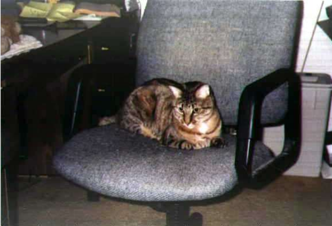
Fluffy loved to sit and sleep in my office chair.

Wednesday, January 2: I took him to the vet for more fluids. The schedule was now for him to come in only once a week unless he has problems.