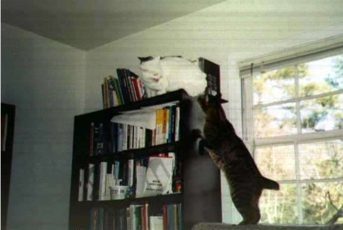
Fluffy loved to bother Frisky.

Saturday, December 22: I took him to the vet for fluids. The hope was that he could go without more fluids until Wednesday. I rinsed his mouth. That evening I also force fed him.