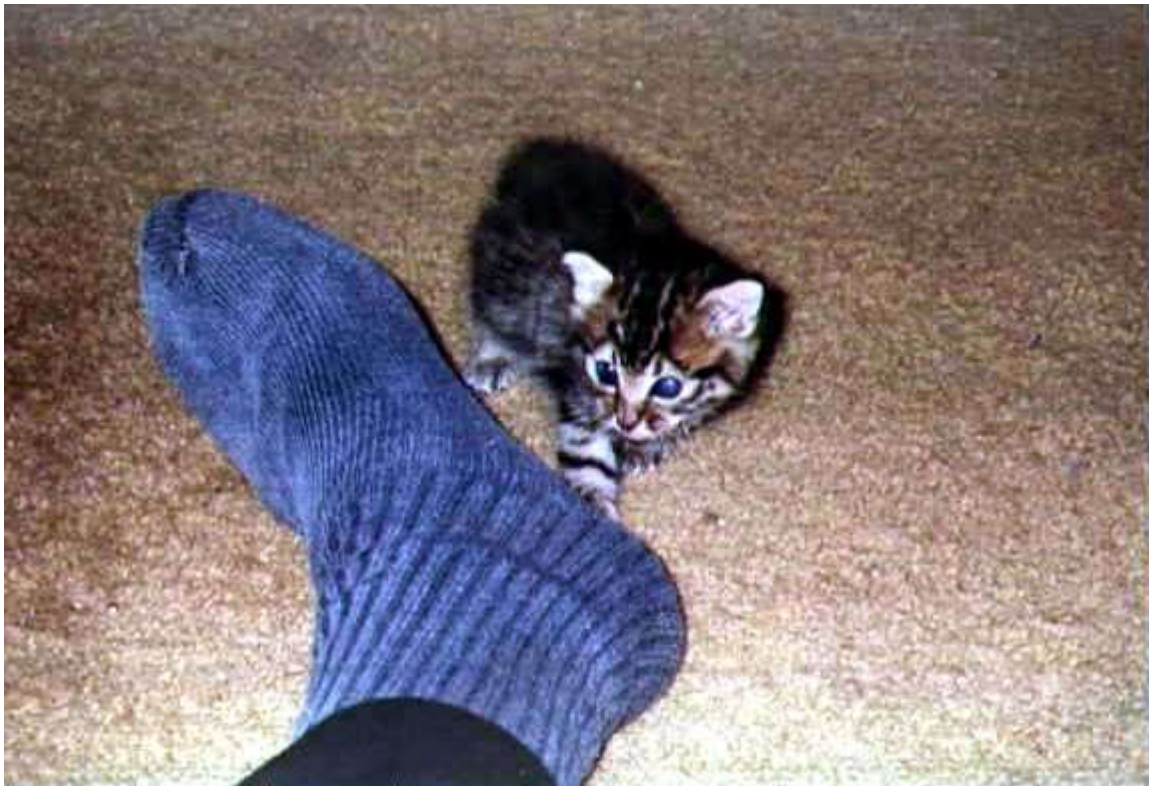
This is the first picture I took of Fluffy the day I found him.

Fluffy was a Manx cat that I found outside my house when he was about 4 weeks old. I always knew that someday this would happen and someday it would probably happen again. Most of this was written after he died. I started writing some things when he was young and well. After Fluffy died I tried to remember every precious thing he did. Some details here serve to help me to remember Fluffy as completely as possible. Here is his story.