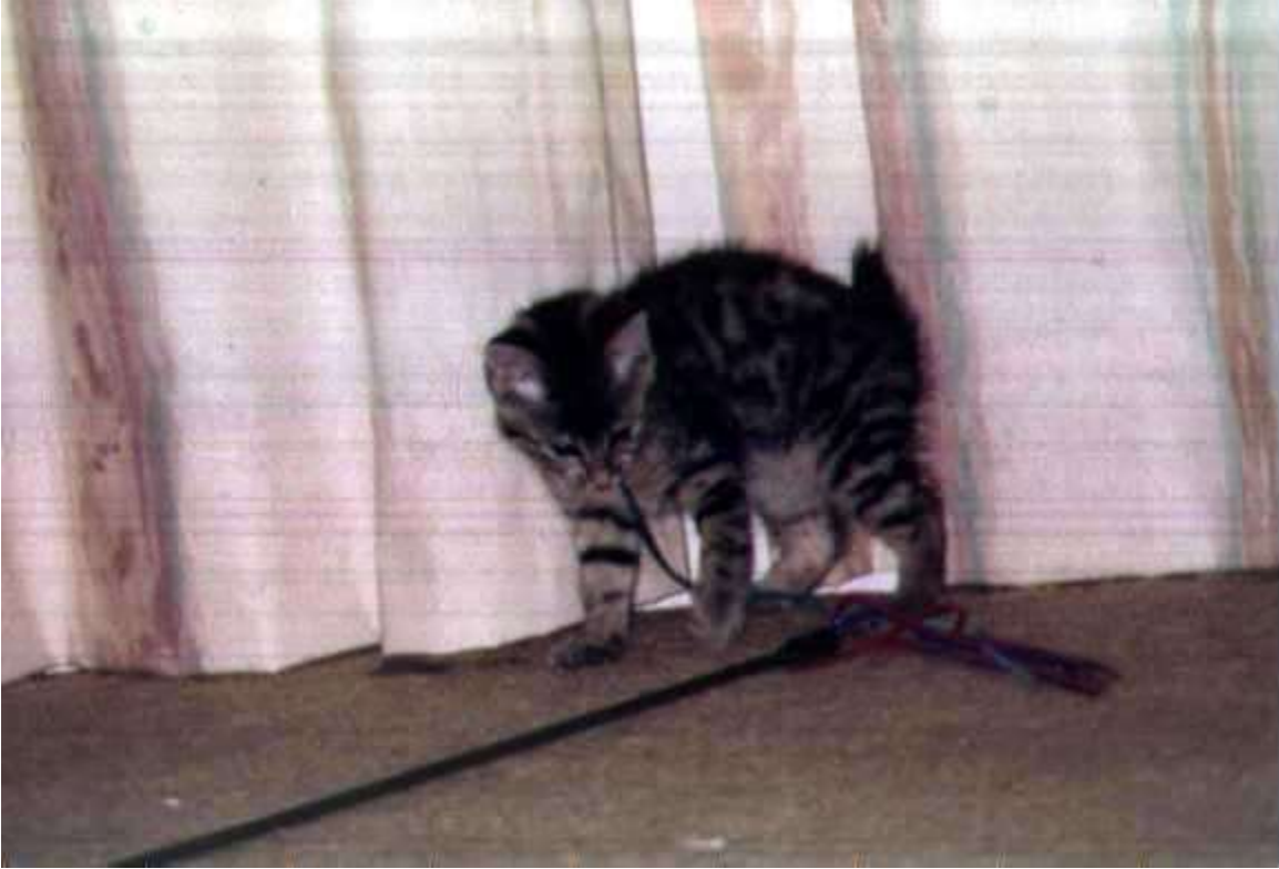
Playing with one of his toys.

Fluffy was a very feisty cat. He definitely had Napoleon syndrome which seems to occur often in short people and animals alike - they use feistiness to make up for being small. I think Spooky was impressed with that and at times I think that Spooky wondered why Fluffy's tail was so short. Although Spooky would hiss and growl at Fluffy he was remarkably tolerant of Fluffy. Spooky even let Fluffy sleep on the bed. Towards the end of Spooky's life he even let Fluffy put his mouth around his neck and gently bite. It was clear to me that Spooky would have Fluffy take his place as top cat.