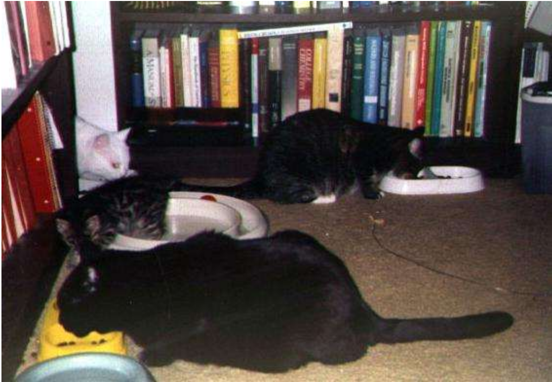
Fluffy loved to go after Spooky's food.

Fluffy was very protective of his food. He would not let any other cat or person be near him when he was eating. He would guard the double food dish with his front paws and would hiss, snarl, growl, and bat the dish with his front paws to make it clear to stay away. The other cats did not know what to think but they quickly learned to stay away. All I had to do was to put my finger near him and he would raise a big fuss squealing and growling. Even in his third year he still made a high pitch squeaking growl when anything got near his food. I sometimes would tease him by bringing one of the toy mice near him. It was so funny to see him fuss so much. He would swat the mice trying to run them away. I would sometimes put on the lion puppet and have it try to steal some of his food. Fluffy would squeal and growl and swat the lion puppet repeatedly. The only exception he made was for Bitsy. At first, he would growl when she got near his food dish but later he let her share the double dish with him. They also ate canned food and ice cream together on the kitchen counter.