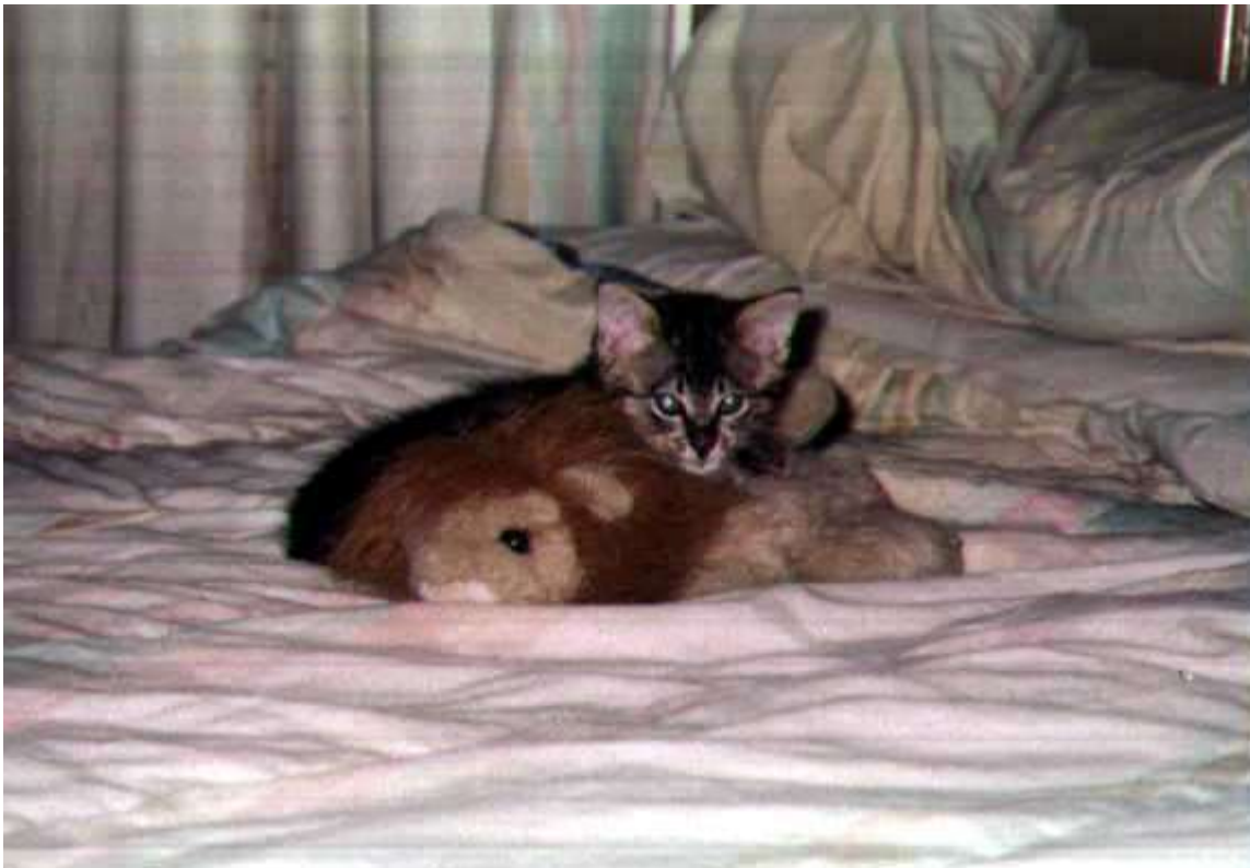
Sleeping with his lion puppet.

I fed him some special canned food for kittens I got at the vet. It took him several weeks to learn how to eat. He would try to suckle the food and get his face all in it and end up a complete mess. Finally, he figured it out.