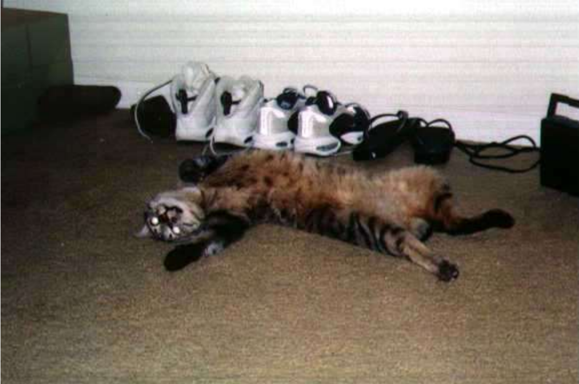
Laying on his back being cute.

Often, I would catch Fluffy. He generally did not like being held and would squirm and kick with his hind legs to get loose. He was very good at squirming. I would lay him on his back on my legs and hold him such that he could not scratch or bite me. I would then pet his head, and he would squeak and do his best to bite me. He would finally start growling at me so I would put him down. He would use his hind legs to try to kick me but mostly he ended up kicking himself in the head. When he was very little, he would repeatedly kick himself in the head when I held him. Later he learned to mostly avoid his head. Fluffy loved to be petted around the head and back but nowhere else. He would get really mad and squeal and growl if I touched his tail or paws.